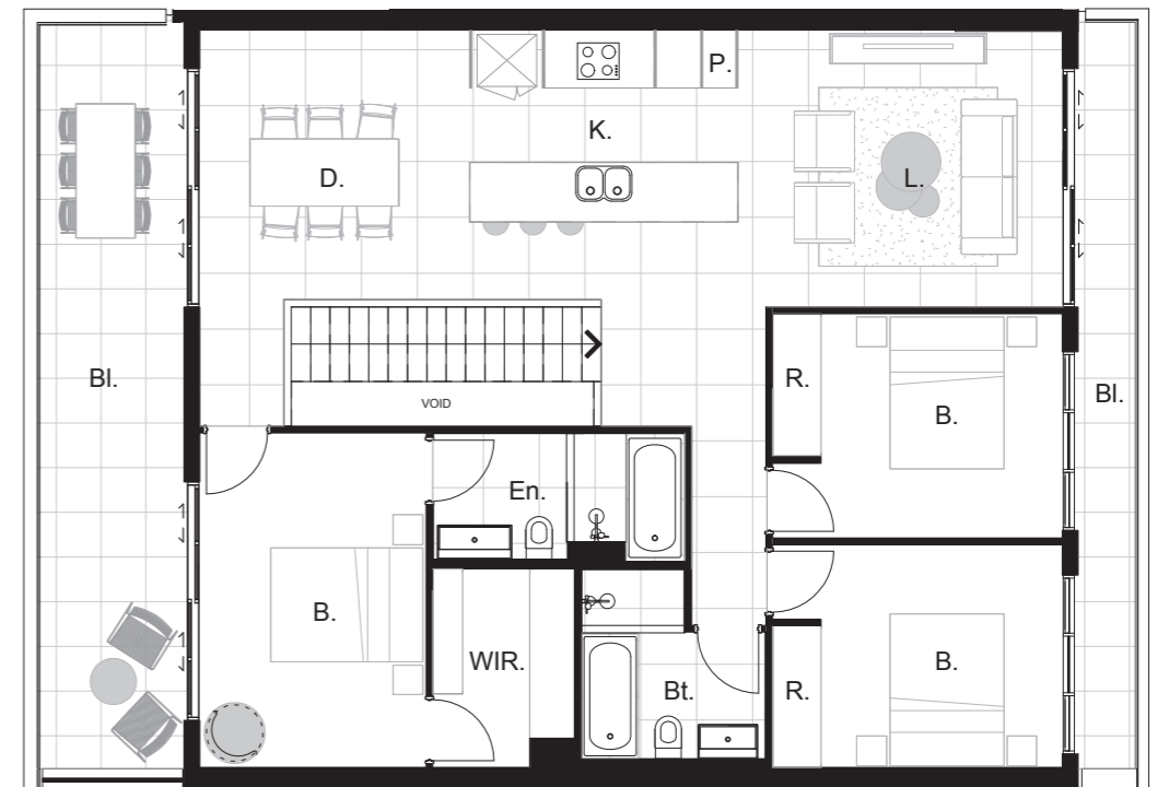
LEVEL 1 - UPPER